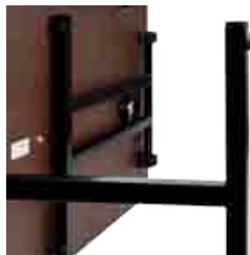
Legs fold flat against the table top