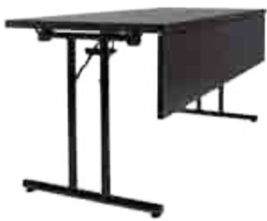
Folding conference table - round leg with modesty panel