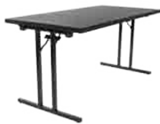
Folding conference table - square leg