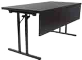
Modesty panel - square leg shown