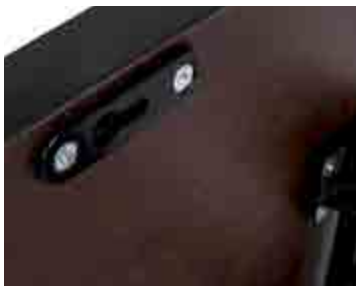
Modesty panels are slotted into a simple keyhole